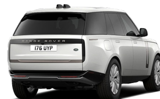
*Image du modèle de l'année précédente présenté *Image of last year's model shown