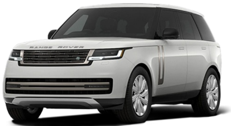
*Image du modèle de l'année précédente présenté *Image of last year's model shown